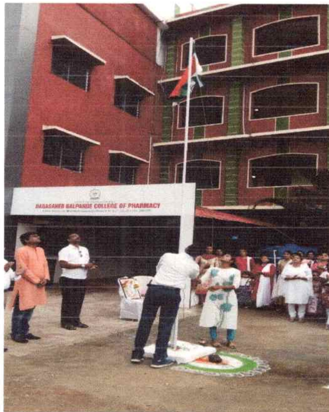
Flag hoisting on 15th August 2018.